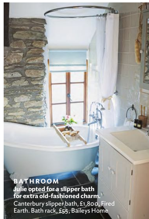
BATHROOM Julie opted for a slipper bath for extra old-fashioned charm. Canterbury slipper bath, £1,800, Fired Earth. Bath rack, £55, Baileys Home

available space. We decided on an open-plan living area on the ground floor, and three bedrooms and two bathrooms upstairs.'