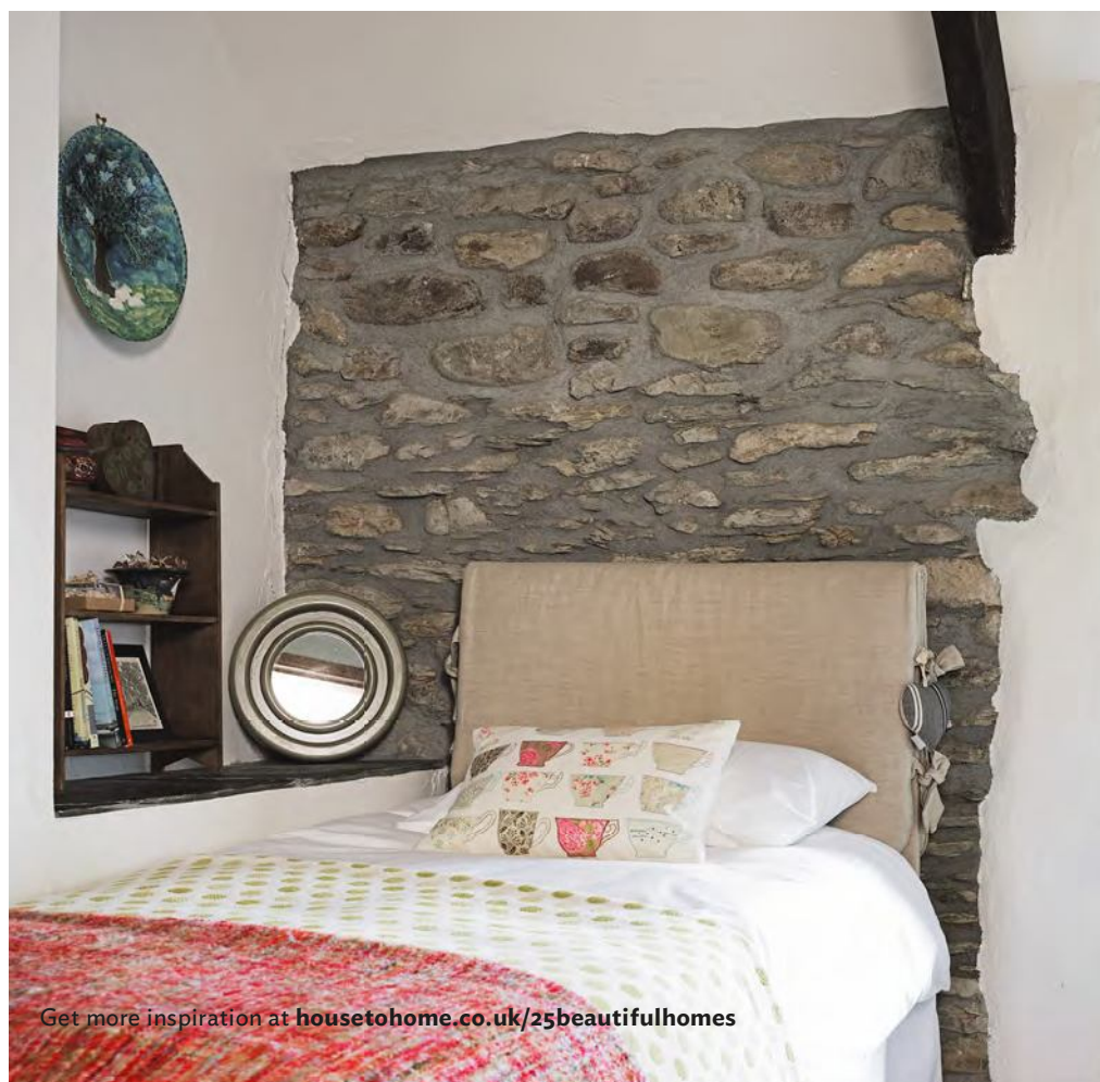
BEDROOM Keeping some of the stonework exposed adds visual interest. Herriot headboard, covered in Adele Natural fabric, from £193, and Lemington Polka Dot throw, £55, both Laura Ashley, are comparable