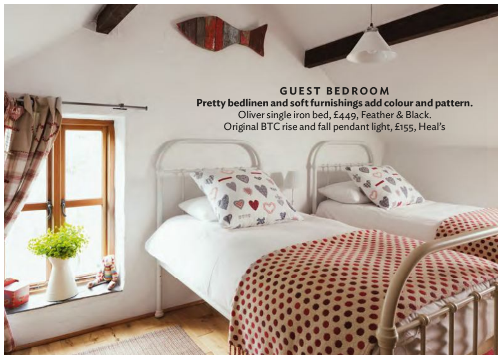
GUEST BEDROOM Pretty bedlinen and soft furnishings add colour and pattern. Oliver single iron bed, £449, Feather & Black. Original BTC rise and fall pendant light, £155, Heal's