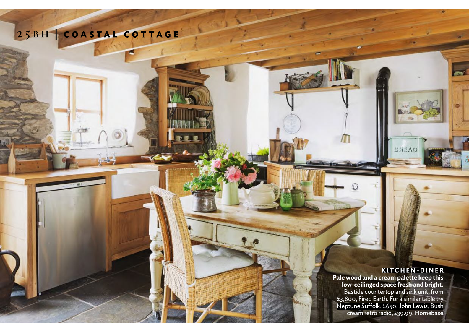
KITCHEN-DINER Pale wood and a cream palette keep this low-ceilinged space fresh and bright. Bastide countertop and sink unit, from £3,800, Fired Earth. For a similar table try Neptune Suffolk, £650, John Lewis. Bush cream retro radio, £39.99, Homebase

DECORATING TIP ‘Get your backdrop sorted and build on that. For me, it was whitewashed and exposed stone walls, grey flagstone flooring and timber beams for warmth’