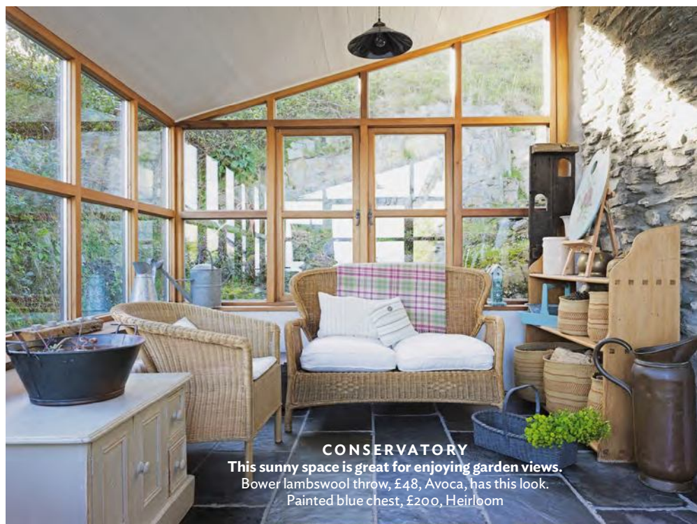
CONSERVATORY This sunny space is great for enjoying garden views. Bower lambswool throw, £48, Avoca, has this look. Painted blue chest, £200, Heirloom